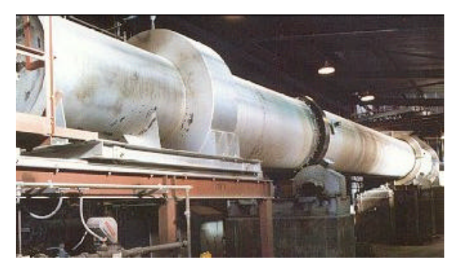
An Anti-delay MFA controller with feedforward and robust functions manipulates coal flow intelligently to achieve tight kiln temp (blue) control.